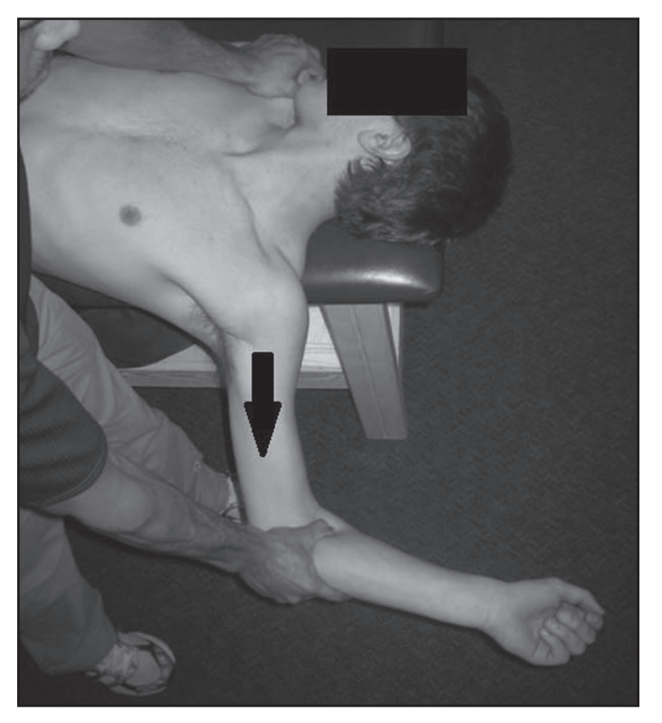
Figure 2. Gross stretch procedure. Arrow indicates an overpressure force applied by the clinician in a direction of horizontal abduction.

A repeated measures analysis of variance (ANOVA) with repeated measures on time was utilized for com-